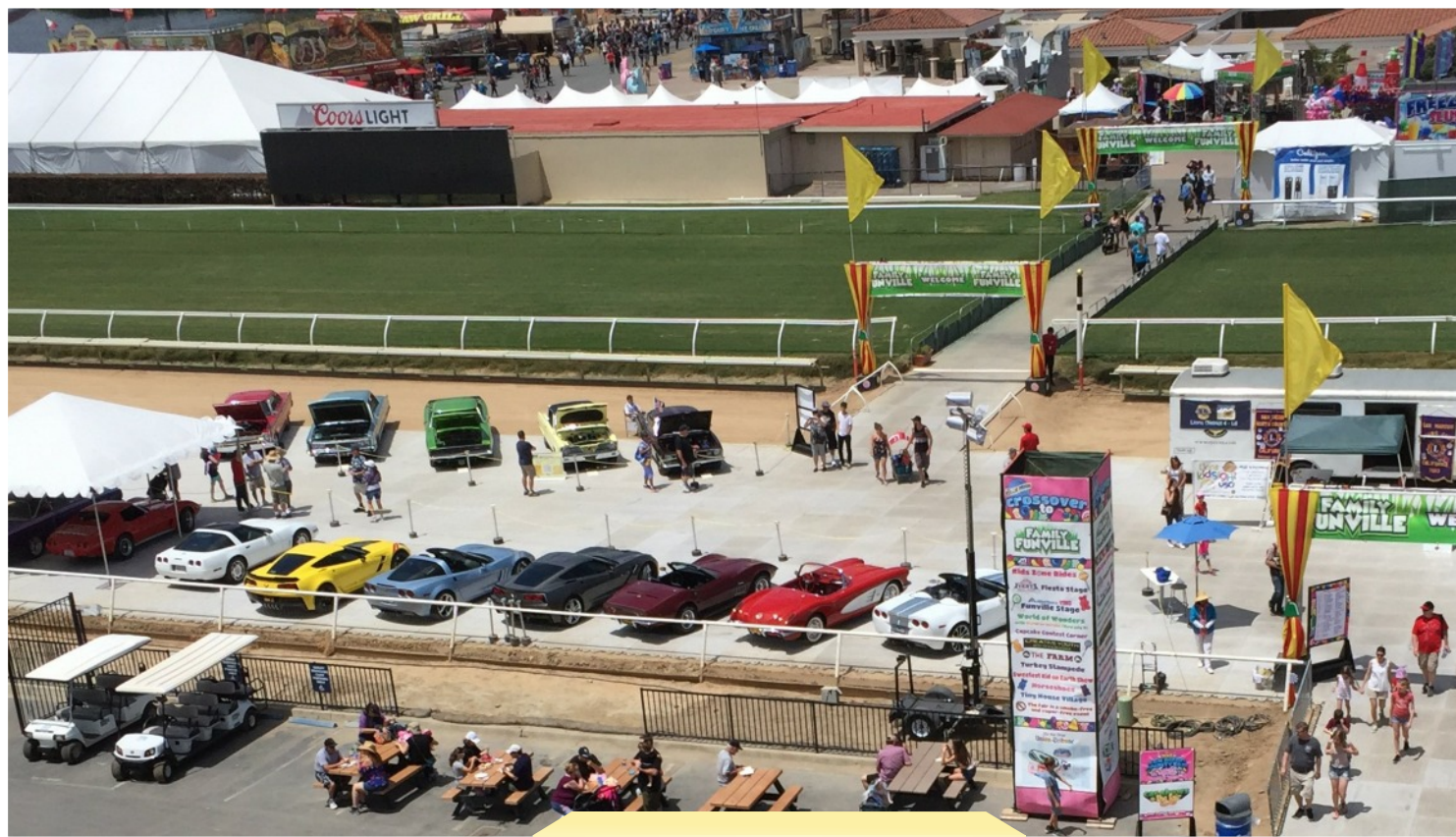
San Diego County Fair

What's Inside: President's Corner Board of Directors Club Events Calendar About Our Club